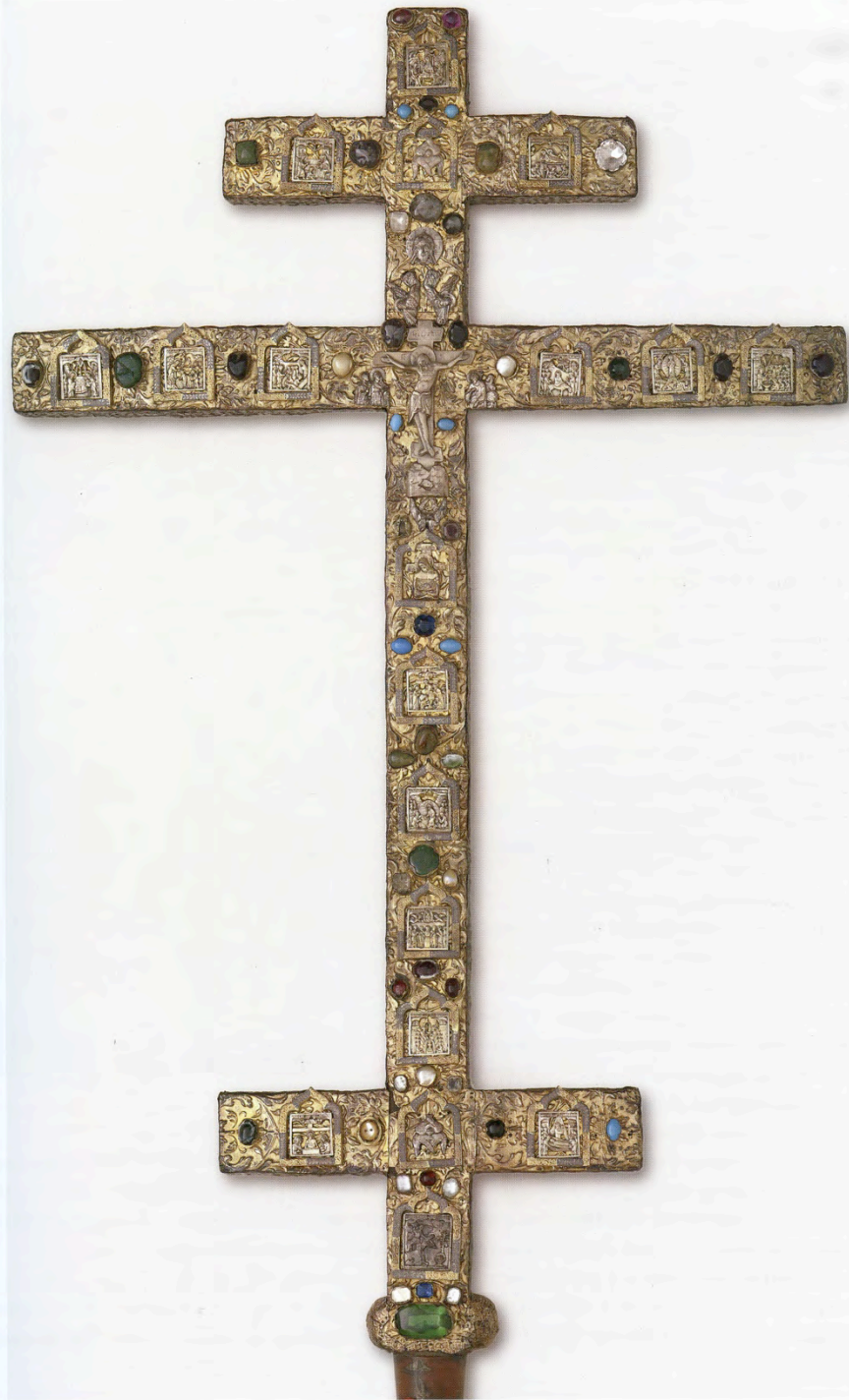
Figure 2: Vera i Vlast' Epokha Ivana Groznogo [Faith and Power: The Age of Ivan the Terrible], T.E. Samoilova, ed. (Moskva, "Moskovskii Kreml'" 2007), plates 6, pp. 42-44.