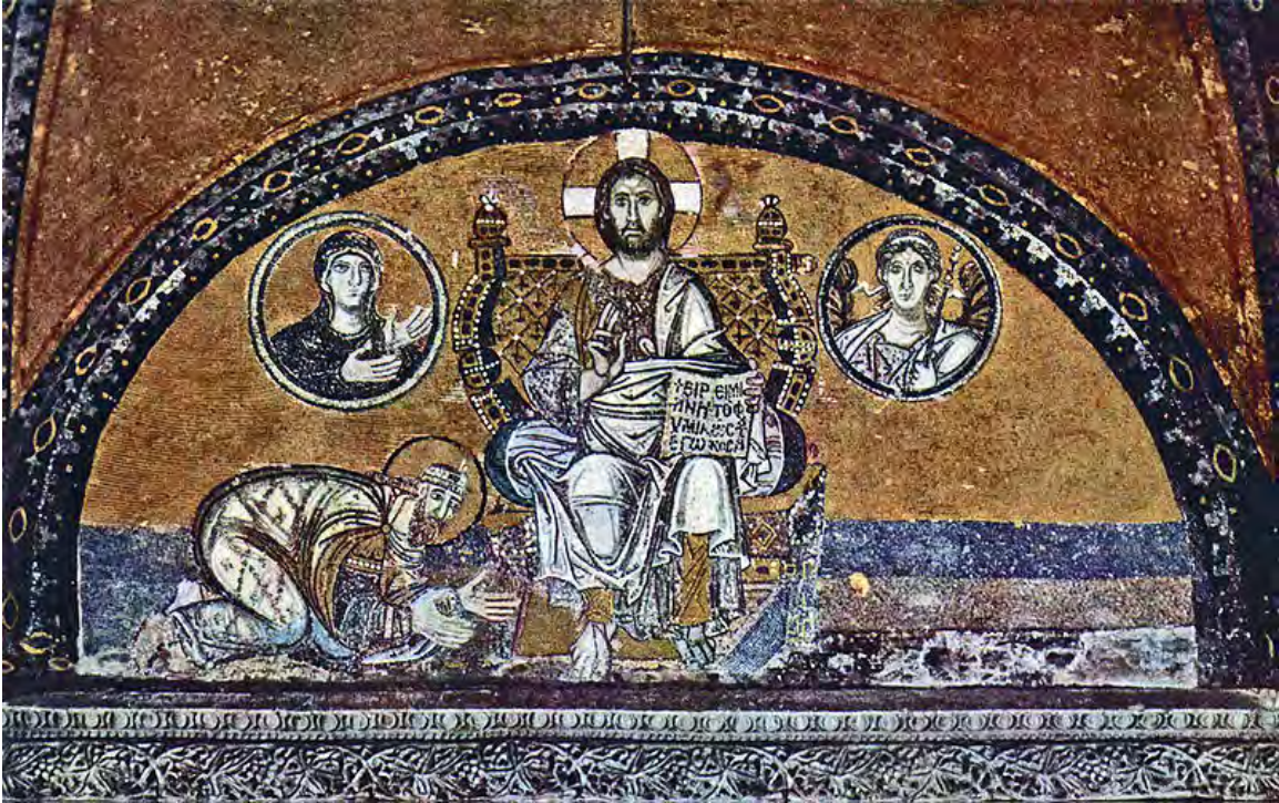
Figure 6: The website Wikopedia commons, the Yorck Project: Mosaiken in der Hagia Sophia, Szene: Christus Pantokrator und Kaiser Léon VI. (886-912) Byzantinischer Mosaizist des 9. Jahrhunderts.