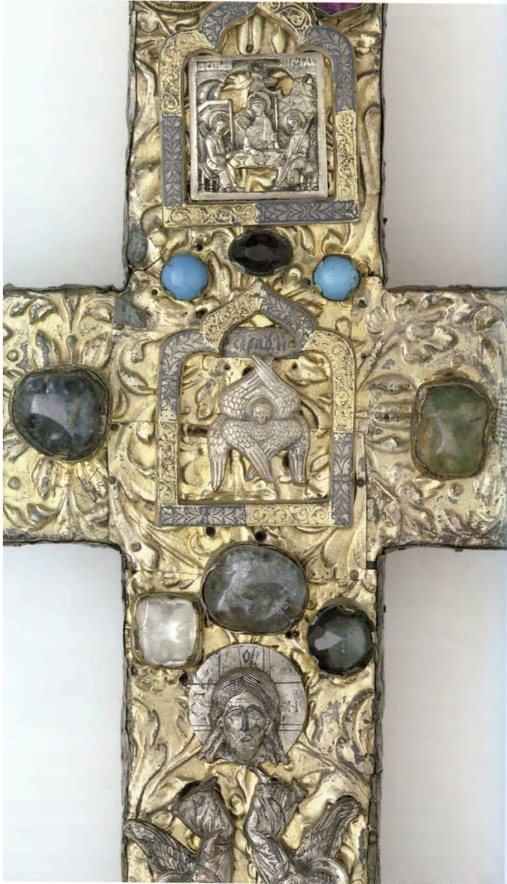
Figure 3: Vera i Vlast' Epokha Ivana Groznogo [Faith and Power: The Age of Ivan the Terrible], T.E. Samoilova, ed. (Moskva, "Moskovskii Kreml'" 2007), plates 5 pp. 42-44.