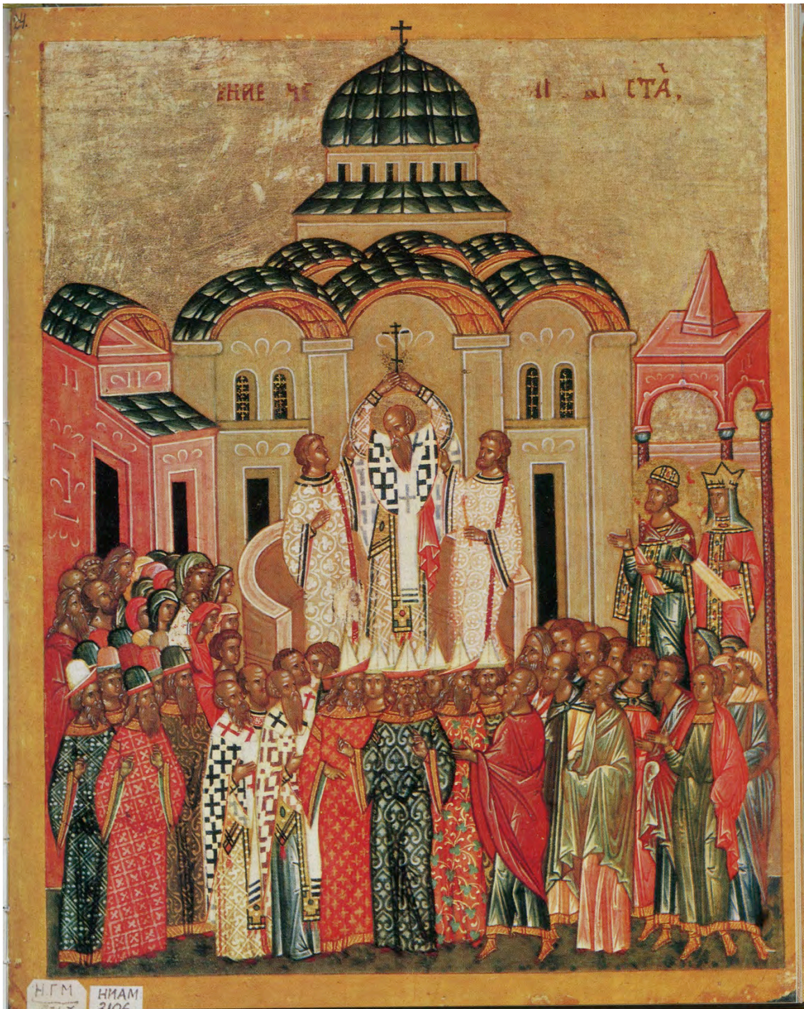
Figure 1: N.V. Lazarev, Stranitsy istoriia novgorodskoi zhivopisi (Pages from the History of Novgorod Painting) (Moscow: "Iskusstvo," 1983), plate III